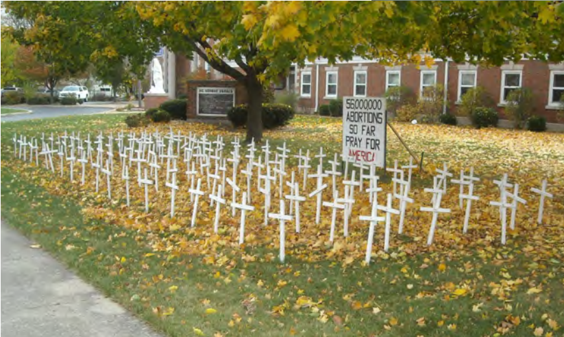
St George, Tinley Park

Pray that we will be able to retire them soon! Vivat Jesus