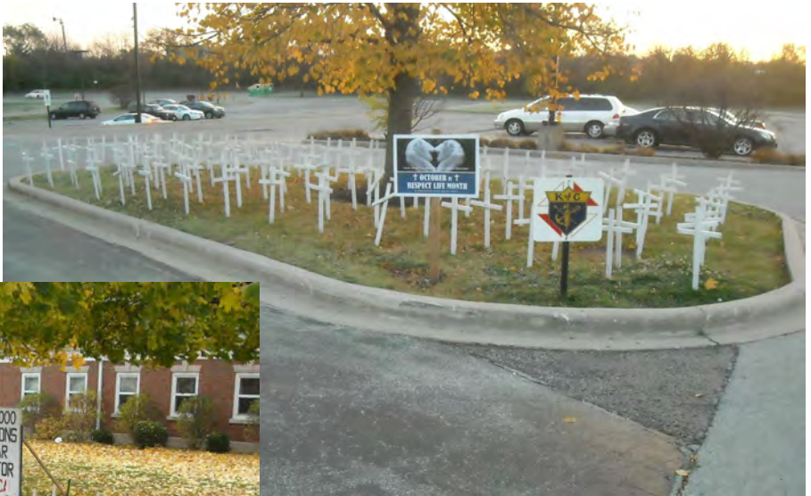
St Mary, Mokena

The council's memorial crosses that remember the horrible facts of abortion were placed on October 1 and removed on October 31. Half were placed at St Mary in Mokena and the